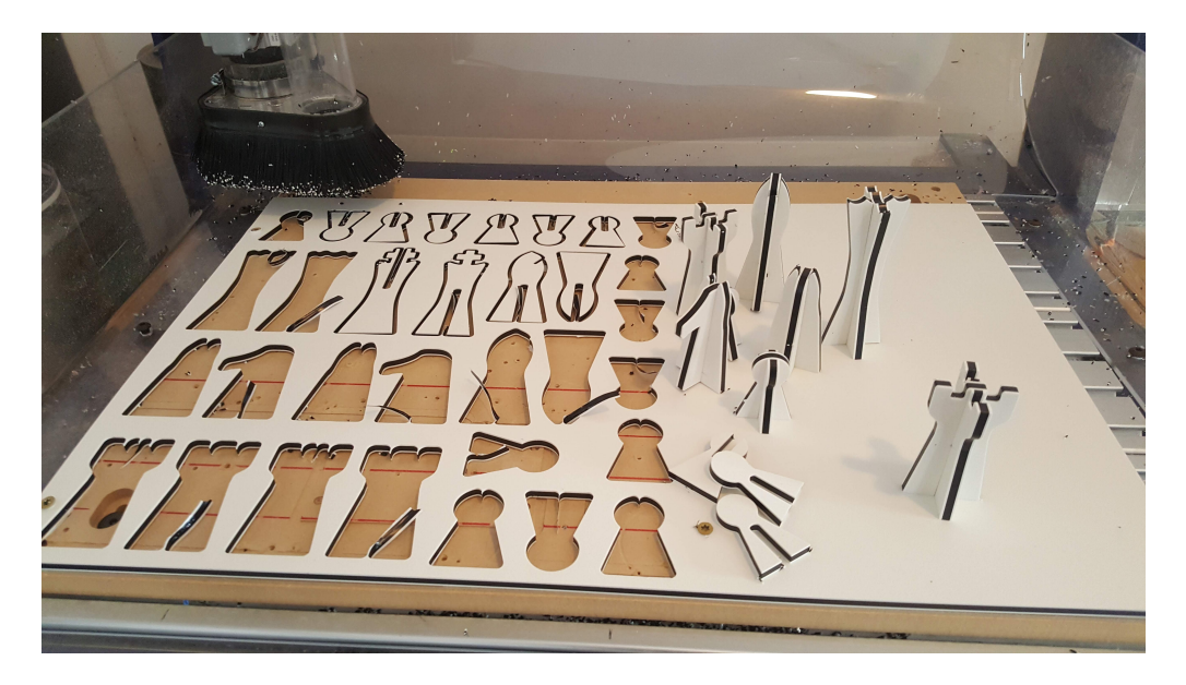
Chess Set from Internet Design