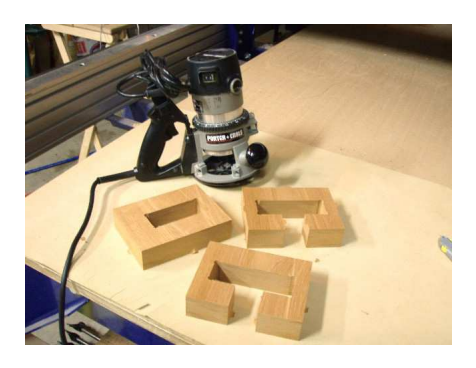
A 1/4" roundover not only brings eye appeal to the puzzle, but makes the puzzle safer to handle on soft hands and contributes to the ease of assembling the pieces.