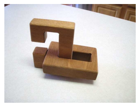
Push the O to the bottom part of the C piece.