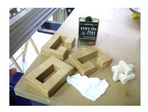
:Use a WipeOn poly and give it several coats to seal up the wood.