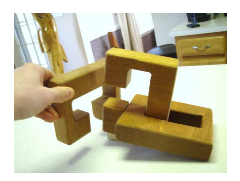
Now slide the 2nd C piece onto the assembly.