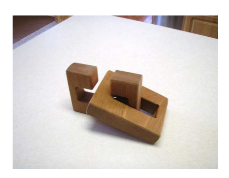
Slide the O piece onto the C piece with the wider end of the O inside the C