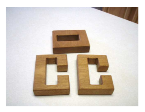
The project is not complete. It is time for the hard part, learning how the puzzle goes together!!!