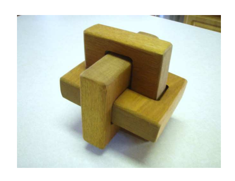
The wooden knot is now tied up. Just reverse the steps to take the knot apart.

As all woodworking projects should go, do a dry run of fitting the pieces together before staining them. Depending on your material thickness, additional sanding may be required to make sure the pieces slide together smoothly.