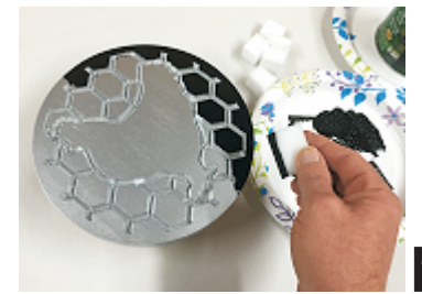
Spread black BBQ paint in a layer on a paper plate, then dipped the foam pad into the paint and dabbed onto the flat surfaces and outer edges of the grid inserts.