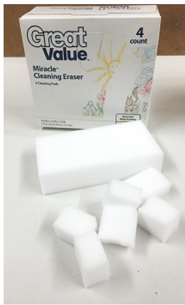
Foam "Miracle Cleaning Erasers" from WalMart™