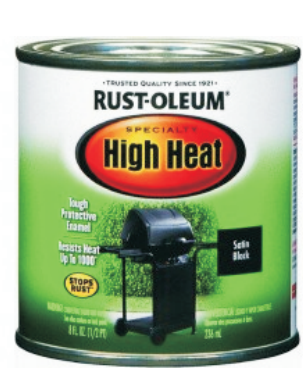
Heat-Resistant Black Brush-on