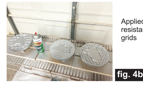
Applied silver heat resistant paint to grids

Used cut up pieces of foam from a magic eraser type cleaning pad. Used factory-flat surfaces to apply paint.