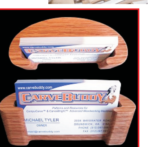
The finished dimensions of each business card holder are 4\frac{3}{4} " W x 2" D x 1\frac{1}{2} " H.