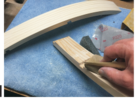
Sand hull surfaces

After the glue is dry, final sand the concave and convex surfaces of both hull halves. (fig. 4d)