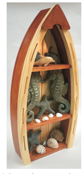
Dimensions are about: 10.25 " W x 21.5" T x 3.625" D

two-tone wood finish on the sample is intended to resemble certain vintage wooden boats from the past. Of course, you may opt for a different type of finish, as you like. A "shabby-chic" pastel perhaps? In any case, have fun with it!