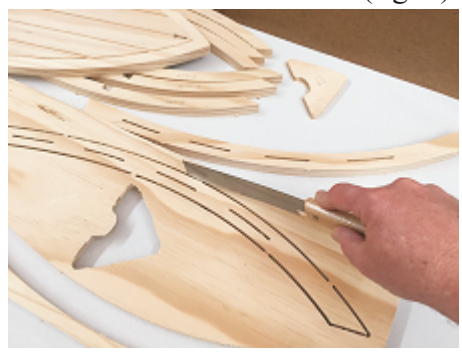
STEP 3 - Separate Parts from Material and Sand Separate the parts from the boards with a utility knife or hobby saw. Sand the components to remove the tabs and undesirable toolmarks. (fig. 3)