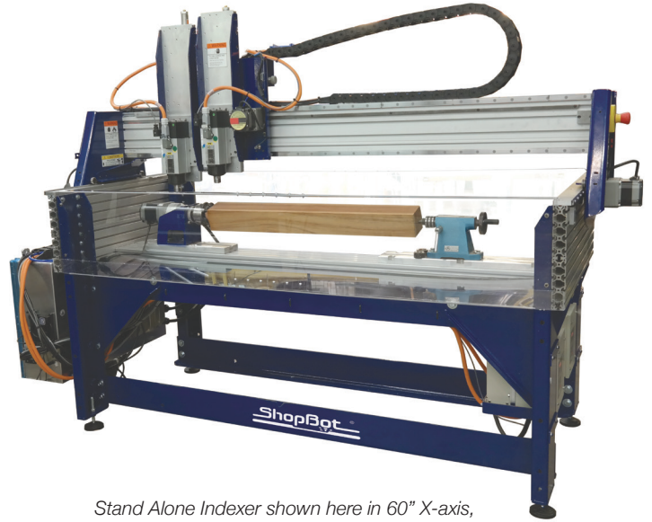
Stand Alone Indexer shown here in 60" X-axis, with a dual Z: 2.2hp spindles, and 6" Indexer.

Give us a call to discuss your production needs. We'll help you choose the right tool to turn your ideas into reality.