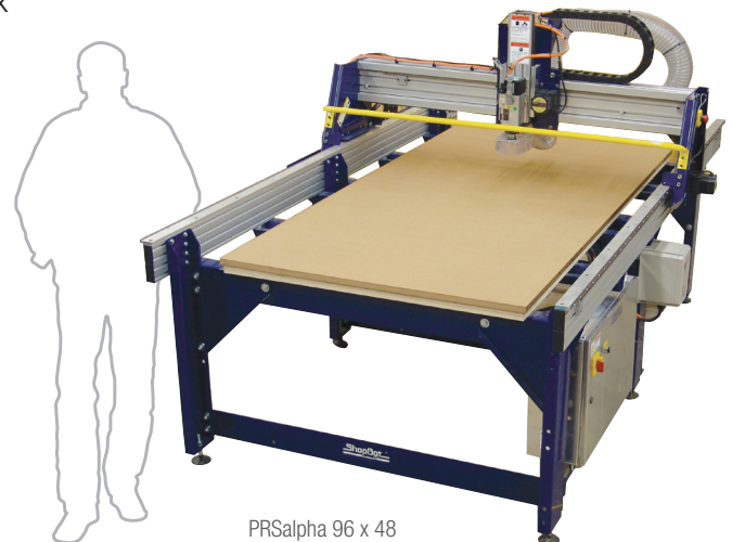
PRSalpha 96 x 48