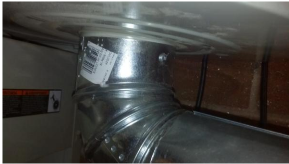
Metal Duct is screwed to collector housing with self tapping screws made for ductwork