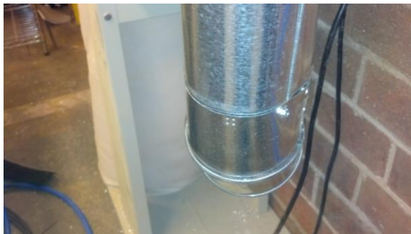
Connection screwed before taping