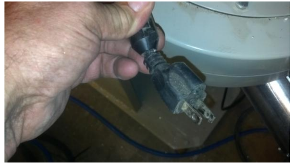
Missing ground lug on dust collector plug (requires adding additional ground wire)