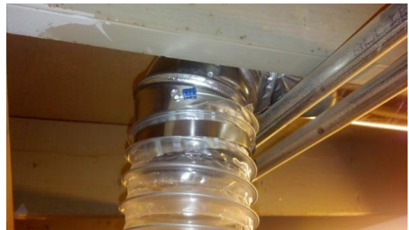
Flex hose clamped to duct and ground wire attached