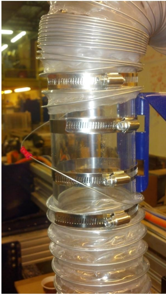
Use and connection of an insulated connection point to the gantry bracket. A piece of 4" OD plastic tube is clamped to the gantry bracket, hoses are clamped to that. Note that the embedded wires have been stripped back and connected with a crimp connector