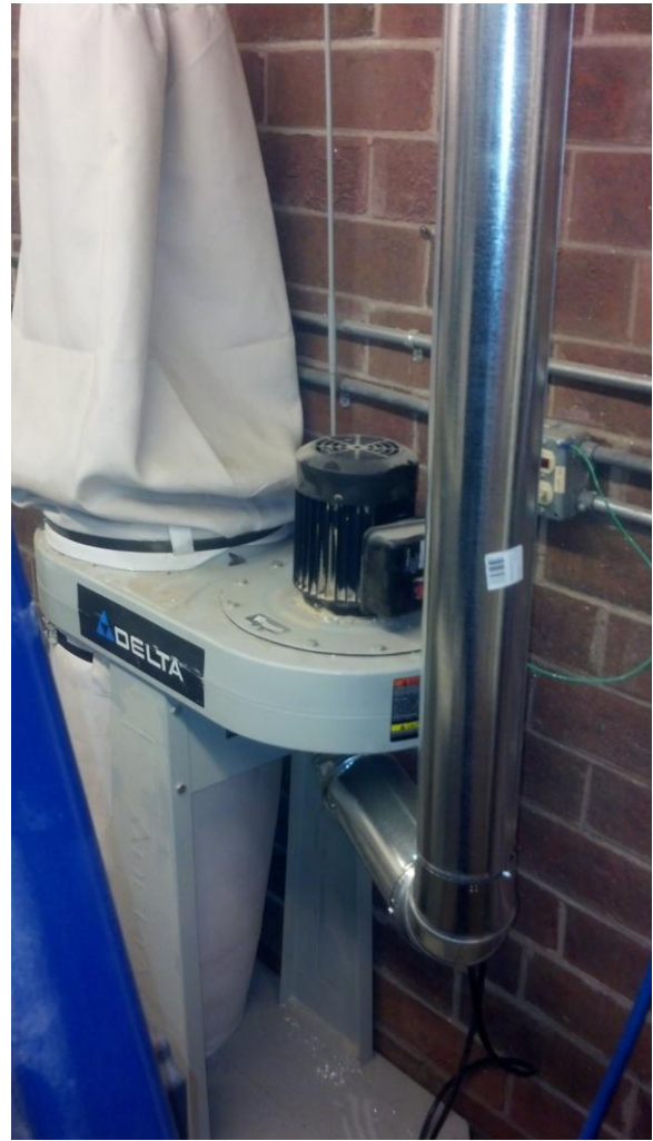
Overall view of metal ducting and collector prior to installing tape