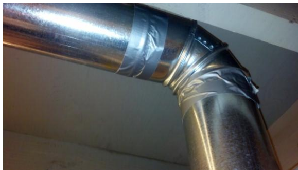
Joints Screwed and taped