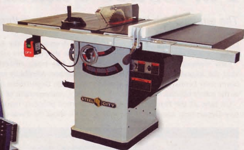
The benchtop CNC from ShopBot Tools, left, and Steel City's granite-top 10" hybrid saw.

Sustainable Forestry Initiative certification could also be found at numerous veneer suppliers and engineered wood dealers.