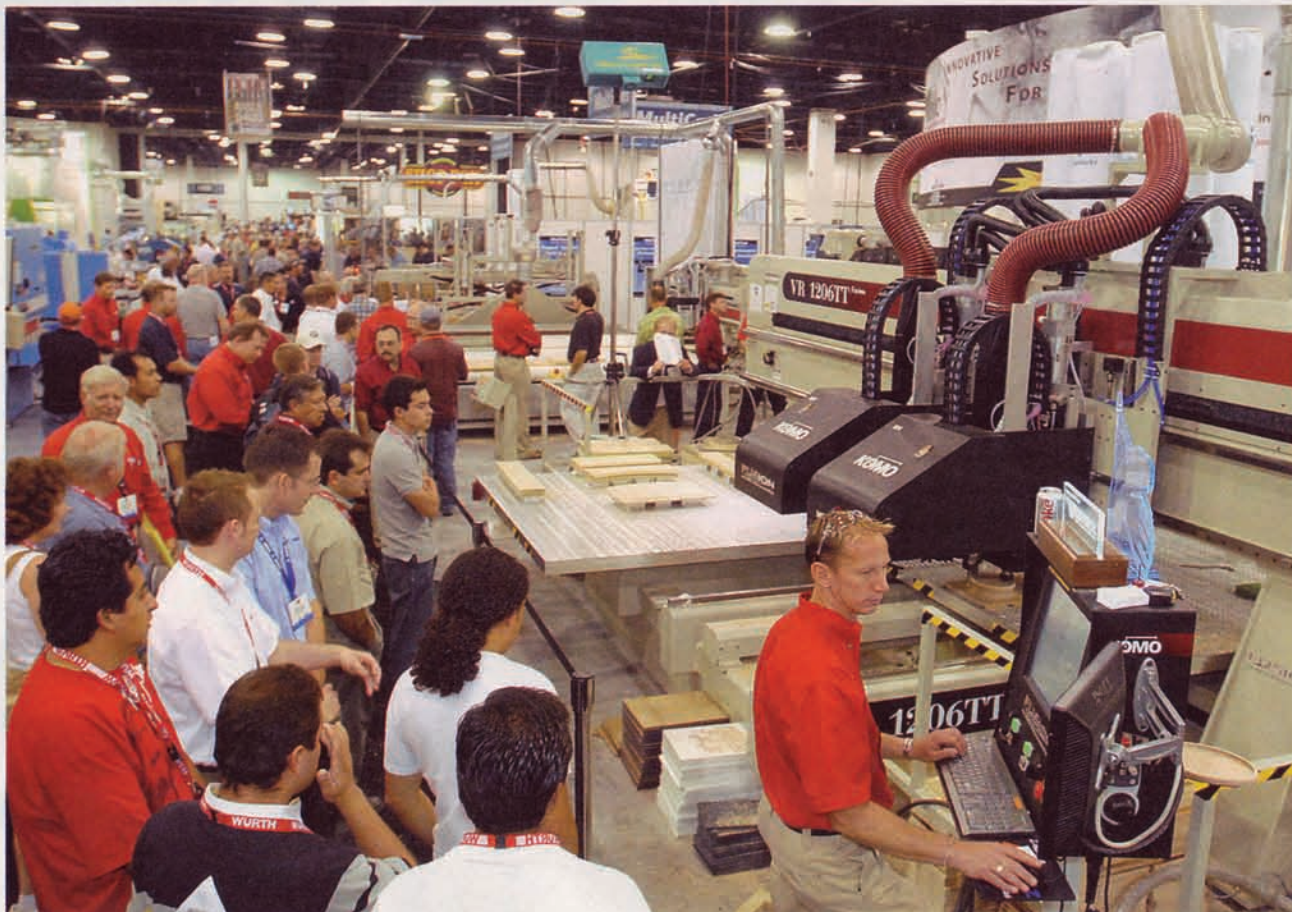
Komo captured the attention of AWFS fair attendees with this CNC demonstration.

Attendees were informed that all Porter-Cable tools will now have a silver metallic look to convey the precise attributes of the brand, along with rich, dark gray and black sections to represent the rugged, traditional standards. Delta tools will have a corresponding metallic silver look.