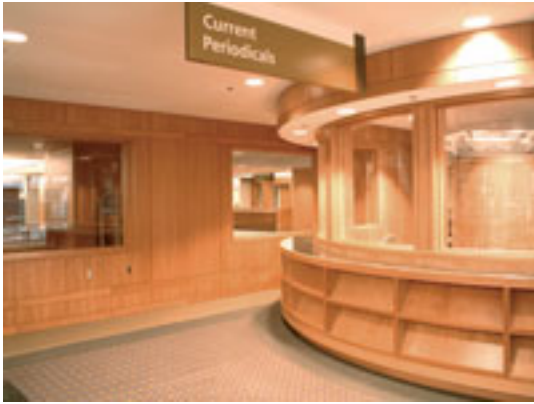
Radius lines are a feature in this desk for the periodicals room at the UNC-Chapel Hill undergraduate library.