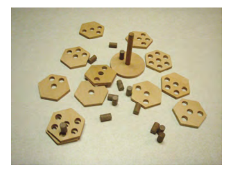
Check all the pieces for any non sanded corners. Finish each piece with a polyurethane of your choice. Minwax wipe on polyurethane works really well for this project.

A walnut or cherry dowel will really accent the project. Cut 13 dowels that are 15/16" long. This can be done with a band saw, coping saw, scroll saw, etc. One dowel 3 7/8" long will also be needed for the center.