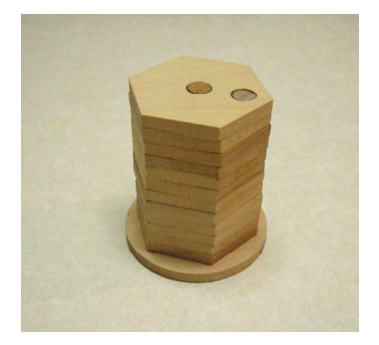
You have figured out the puzzle when all of the pieces fit together like this.

Simply start stacking pieces, filling the holes with dowels; in order to win the game all of the dowels and all of layers need to be used.