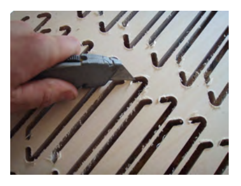
Once the file is complete, flip the work piece over and cut the tabs with a utility knife. If you try to push them out by hand it could lead to tearing out on the wood and take away from the projects appearance.